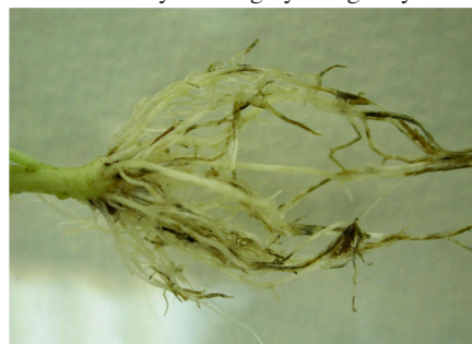
Figure 5. Thielaviopsis signs on a root system.

black areas of the root with a microscope you would see masses of chlamydo spores (Figure 6),