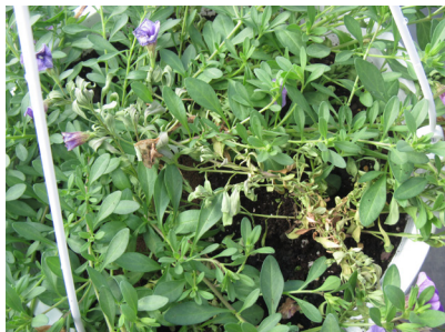
Figure 4. Thielaviopsis symptoms on a hanging basket.

chelate at 4 oz/100 gallons, be sure to wash off the foliage with clear water following the drench. In some cases you may need to get the plants to green up in a short amount of time, iron chelate foliage sprays can be used (4 oz/100 gallons).