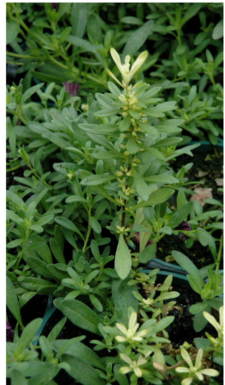
Figure 2. Advanced symptoms of iron deficiency.

There are a number of reasons why the substrate pH on calibrachoa or any crop increases over time. Peat substrates are often amended with lime to raise the pH, check the pH of your substrate before you use it to pot up your calibrachoa to ensure that the initial pH is not too high. In areas of the country where water alkalinity is high the pH will increase over time