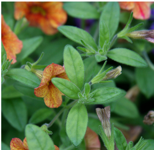
Figure 1. Early symptoms of iron deficiency

due to the water alkalinity. Have your water tested on a regular basis (1 to 2 times per year) to monitor the alkalinity in your water. You may need to treat your water with acid if your alkalinity is