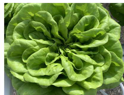
Figure 1. Example of a healthy head of lettuce grown hydroponically

Reprint with permission from the author(s) of this e-GRO Alert.