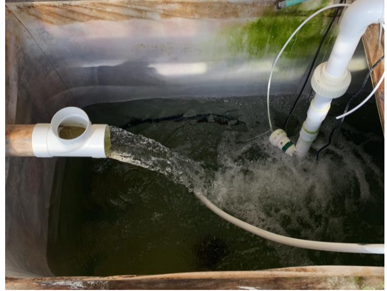
Figure 3. The nutrient solution reservoir for a commercial NFT system