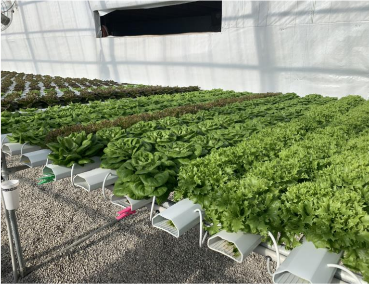
Figure 2. Multiple varieties of lettuce growing in a commercial NFT system