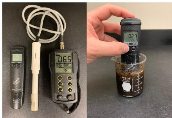
Figure 1. Hand-held and portable meters that measure both pH and EC (left). Using a hand-held pH/EC meter to conduct a 2:1 soil test (right).

Testing pH and EC. Monitoring irrigation water EC is important because soluble salts can fluctuate throughout growing seasons, influencing fertilizer and irrigation practices. Checking pH and EC of applied fertilizer and hydroponic nutrient solutions helps determine whether fertilizer and mineral acid injectors are working properly. Measuring root substrate pH and EC can indicate the quantity and availability of nutrients for plant uptake.