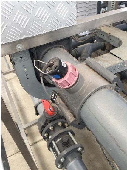
Figure 4. Electrical conductivity (EC) sensor plumbed into an irrigation pipe.