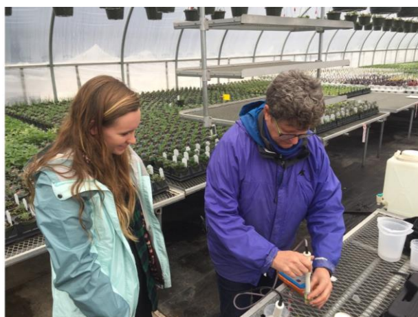
Figure 2. Grower (right) and university student (left) calibrate a portable pH/EC meter just before taking measurements in the greenhouse.