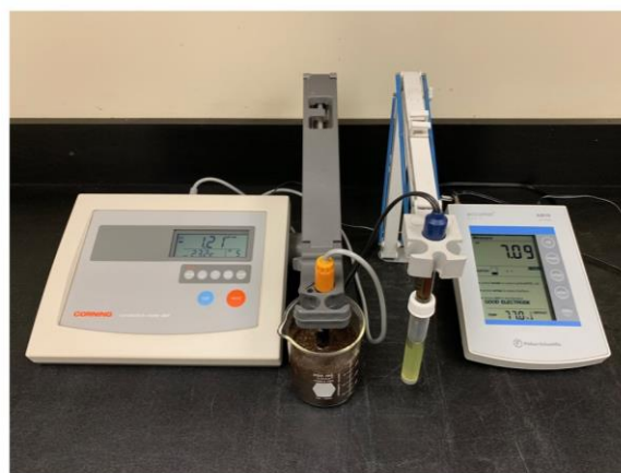
Figure 3. Examples of bench-top meters, where the console and sensor on the left is for EC and on the right for pH. Some bench-top meters have both pH and EC sensors.