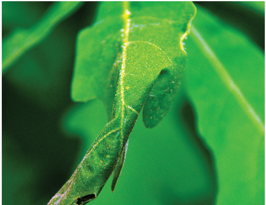
A local Oak leaf that is expressing leaf development abnormality due to chill damage. The temperature rapidly dropped from 74 degrees F to 35 degrees F within 4 hours. Even natives have issues you can spot with a trained eye.

Then there is the effect temperature has on the rate of the biochemical reactions! This is where the problem lies. It's called "Q-10." The Q-10 refers to how a biological reaction responds to a change in temperature within the temperature limits of a plant. Let's use African Violets. They prefer to