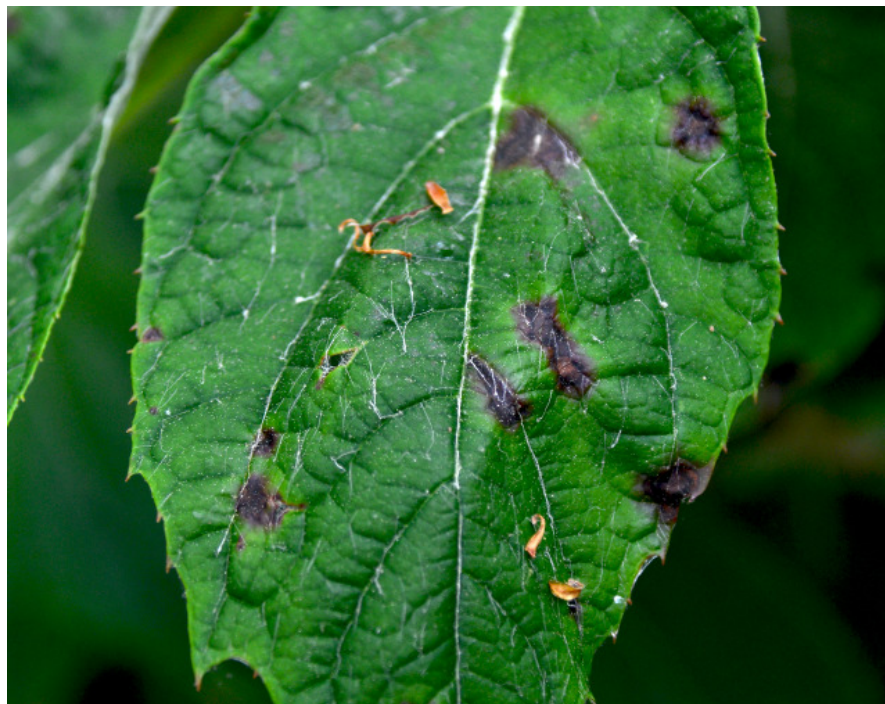
This is a hybrid landscape Hydrangea leaf 10 days after outdoor temperatures dropped to 35 in Athens, GA. There was no frost, but the new, expanding leaves suffered none the less.

To give you an example, we all know African Violets often develop clear spots on their leaves after being watered with cold water on a sunny day. In my greenhouse class, students who watered their violets with well water at 7:00 am had no spotting! Those that watered with well water at 3:00 pm had serious spotting. What gives? It's all about the cell system!