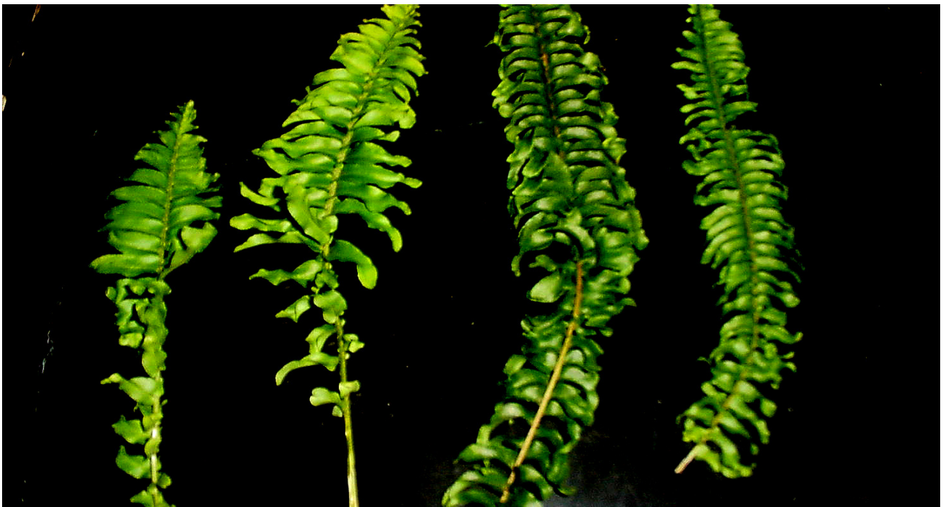
Ferns showing chill damage on the lower portion of the frond from a grower allowing temperatures to drop to 45 degrees to save money during the Spring. Ferns were then taken into a warm greenhouse. Notice the Pinnae development returns to normal as the fern frond continues to develop.

The cell doesn't turn brown, shrivel or even fall off...it just sits there, damaged. If the