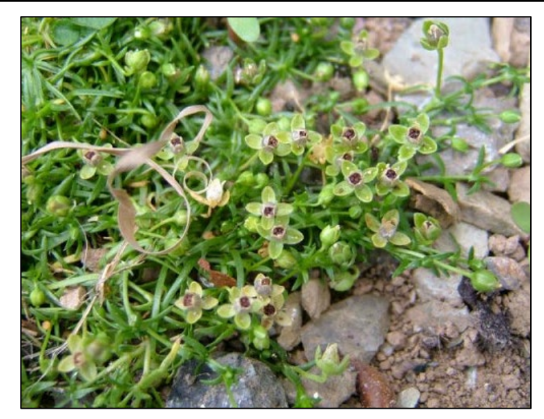
Figure 6. Fruit of Birdseye pearlwort is a capsule which contains numerous minute seeds.

its ability to cover the ground. This branching and rooting characteristic helps it thrive in areas like lawns, roadsides, or gravelly substrates (such as around nursery/greenhouse containers), making it a robust groundcover species [7].