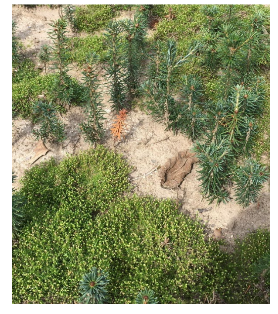
Figure 1. Birdeye pearlwort growing like a mat.

Birdeye pearlwort (Sagina procumbens), also known as pearlwort, belongs to the Caryophyllaceae family. It is a low-growing, moss-like plant that typically behaves as a spreading cool-season annual. However, under favorable conditions, it can also persist as a short-lived perennial. This plant often forms small mounds in nursery containers, though it can also spread out as a prostrate mat (Fig. 1), especially in gravelly areas surrounding the containers.