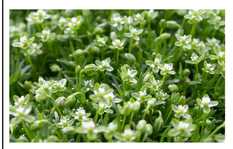
Figure 4. Small inconspicuous flowers of pearlwort.