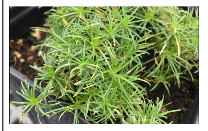
Figure 3. Highly branched stems of Sagina procumbens .