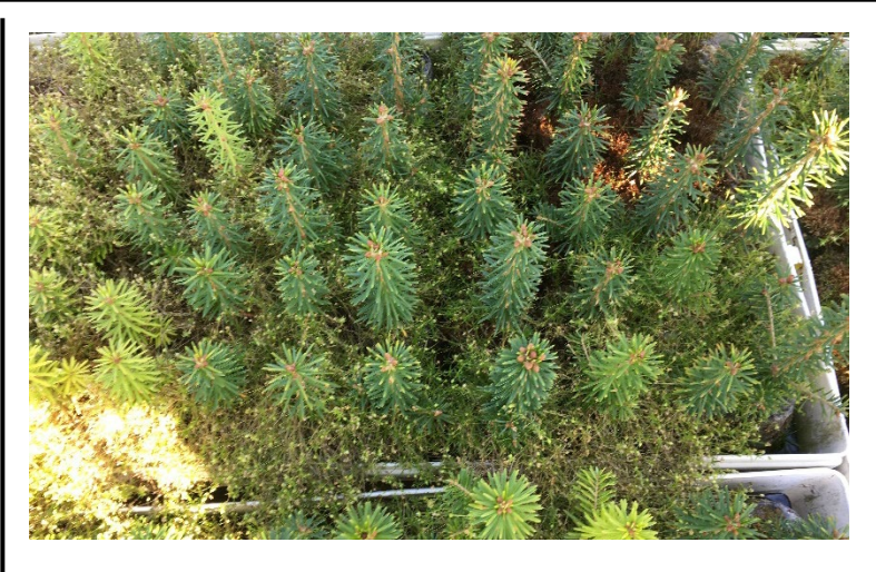
Figure 2. Birdeye pearlwort competing with container-grown Christmas tree seedings grown in greenhouse conditions.

Stem: The stems of Birdseye pearlwort are green, hairless, and typically much branched (Fig. 3). These stems grow from the base and either ascend or, more commonly, grow prostrate along the ground. As the stems spread out, they root at the nodes, which enables the plant to form a mat-like structure that enhances