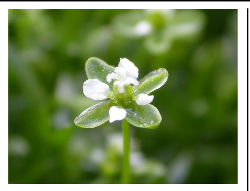
Figure 5. A magnified single flower with four tiny white petals, which are often smaller than the green sepals that enclose them.