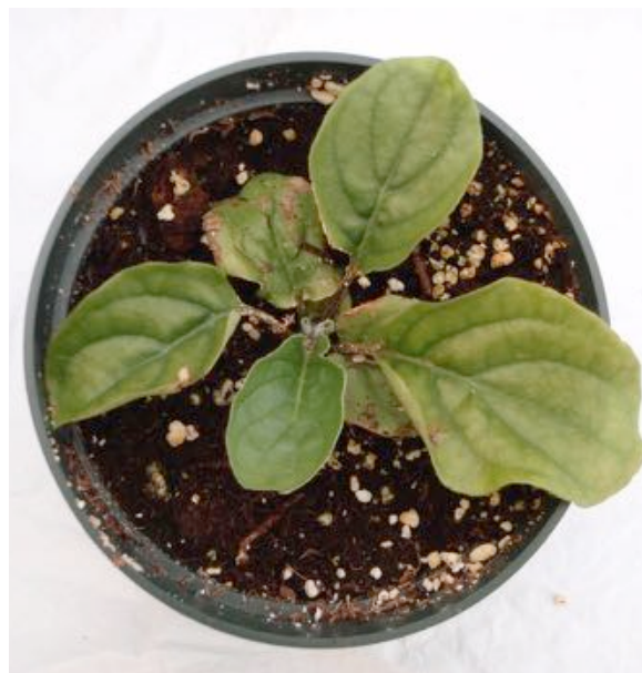
Figure 1. Ammonium toxicity can be observed when plants are grown using a higher ammoniacal percentage fertilizer under cool and dark conditions.

Fertilizers can fall into one of three categories acidic, neutral, or basic. This is generally dictated by the ratio of ammoniacal ( \text{NH}_4^+ ) (acidic) or nitrate ( \text{NO}_3^- ) (basic) nitrogen source. Each fertilizer blend has a different amount of potential acidity or basicity (Table 1). Pairing a fertilizer that balances out the alkalinity in your irrigation water will help prevent the substrate pH from increasing above the recommended ranges.