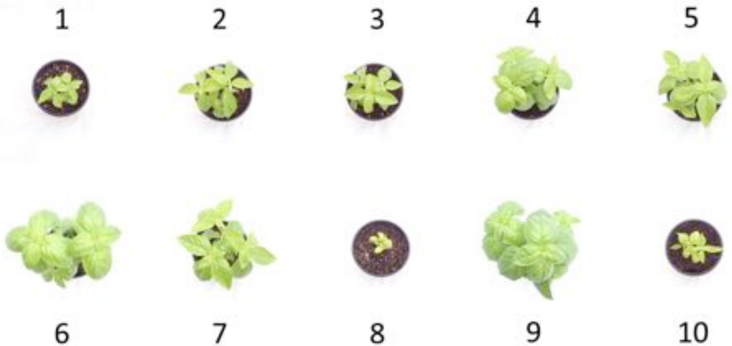
Figure 2: Observed top plant growth after 6 weeks of total growth when plants were irrigated with clear water and no additional fertilizers were supplied.

of nitrate compared to ammonical or urea nitrogen (Table 1). Additionally, the substrates that included a nitrate pre-plant charge also exhibited increased potassium, calcium, magnesium, and sulfur in the substrate. However, when the substrate EC is excessively high for young plants, stalled growth or girdling at the soil line can occur. Knowing your substrates initial pH and monitoring changes overtime can be useful to allow for changes in growing practices before problems occur.