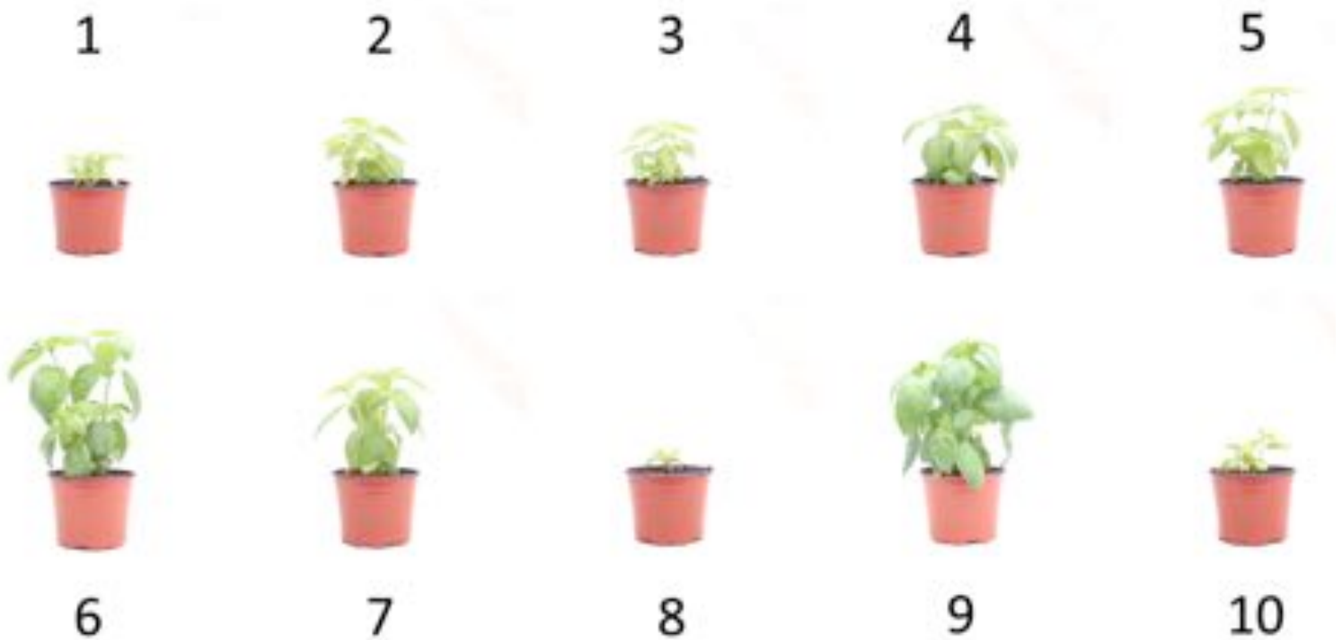
Figure 1: Observed side plant growth after 6 weeks of total growth when plants were irrigated with clear water and no additional fertilizers were supplied.

A pre-plant fertilizer charge is included during the manufacturing process that is intended to provide nutrients to the crop immediately following transplant for a short period. The composition of a preplant charge can be a variety of forms ranging from inorganic and organic granular nutrients to organic matter including compost. In contrast, post-plant fertilization is supplied by the grower after transplant. Post-plant fertilization programs can be implemented in many forms ranging from water-soluble fertilizers to controlled-release or slow-release fertilizers. Additionally, growers can utilize a combination of these two strategies, a preplant fertilizer charge to help encourage plant growth initially, followed by post-plant fertilization. However, growers should test the chemical properties of their substrate to optimize their fertilization program if preplant charges are included. Matching your nitrogen (N) source for your desired plant characteristics is important, higher percentage nitrate fertilizers will produce more compact plants while fertilizers containing higher ammoniacial percentages will produce darker green more lush growth but with more stretch.