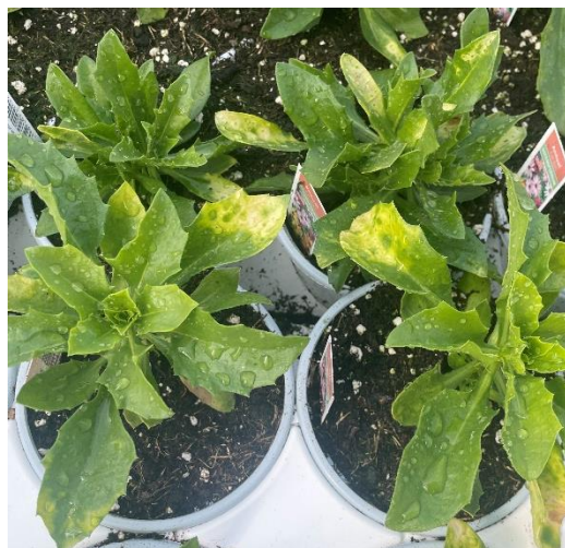
Figure 1. The chlorosis seen on the foliage of these osteospermum is the result of a foliar chlormequat chloride spray. While chlormequat chloride is a good PGR for osteospermum, phytotoxicity can occur at appropriate concentrations when an excessive volume of solution is applied.

This osteospermum crop started to exhibit chlorosis on leaves. The distribution of the symptoms across the crop as well as individual plants, made it clear this wasn't any nutrient deficiency. It started showing up after an application of chlormequat chloride (Citadel, formerly Cycocel now Altercel) was made.