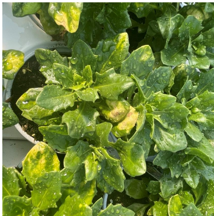
Figure 4. Mild chlorosis caused by chlormequat chloride sprays usually greens-up by the time a crop is finished. However, if chlorosis advances to the point of necrosis as seen here, new, healthy leaves must be produced to cover up the damage and maintain the marketability of the crop.