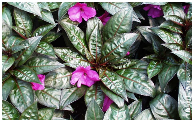
Figure 6. Overfertilization or excessive electrical conductivity (EC) can result in the upper leaves of New Guinea impatiens to appear shiny and wavy, rippled and/or cupped.