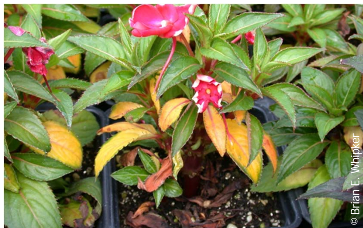
Figure 5. Providing insufficient fertility [low electrical conductivity (EC)] during New Guinea impatiens production can result lower leaf chlorosis (yellowing).