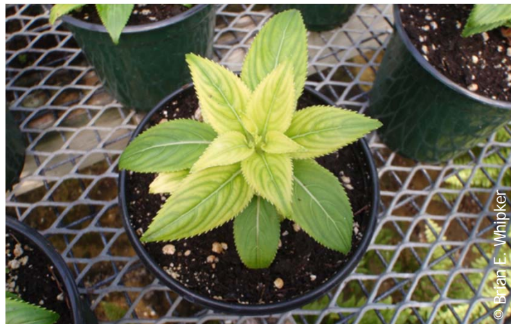
Figure 4. As a result of high substrate pH, severely iron (Fe)-deficient New Guinea impatiens exhibit intensified interveinal chlorosis where recently matured leaves become white and mature leaves are also affected.

Maintain substrate EC below 0.6, 1.3, or 2.0 mS/cm, based on the 1:2 Extraction, SME, or PourThru methods, respectively. During early stages of growth, providing too little fertility can cause lower leaf chlorosis (yellowing; Fig. 5), leaf drop, poor branching and thin plants (Nau, 2011). Overfertilization will cause leaves to appear dark, bluish tinged, shiny, wavy, rippled and/or cupped (Fig. 6; Nau, 2011; Dole and Wilkins, 2005). When EC values exceeded 1.5 mS/cm determined by the SME method, stunted growth and delayed flowering can occur (Gibson et al., 2007). To avoid high EC, it is recommended to leach with clear water every third or fourth irrigation (Nau, 2011). An alternative is to monitor the substrate EC levels, and if the substrate EC levels is increasing over time, then switch to a few irrigations with clear water. This helps avoid flushing out fertilizer that you already paid for and provided to the crop. Fertilizing with excessive ammoniacal-nitrogen ( \text{NH}_4\text{-N} ) has been reported to promote undesirable leaf expansion (larger leaves) and poor flowering