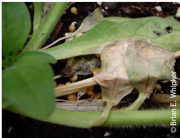
Figure 2. Excessive EC along with drought conditions can result in the leaves of calibrachoa developing leaf scorch.