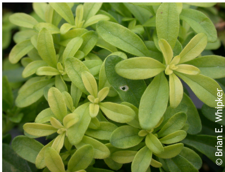
Figure 3. Substrate pH above 6.5 can inhibit Fe uptake causing newly developed leaves to become deficient in Fe and exhibit interveinal chlorosis.

This range prevents low substrate pH induced iron (Fe) and manganese (Mn) toxicities that may occur if the pH drifts lower than 5.2 to 5.5. Substrate pH values above 6.2 inhibit Fe availability and result in the upper foliage developing interveinal chlorosis. Elevated substrate pH induced interveinal yellowing (chlorosis) is the primary nutritional problem associated with calibrachoa.