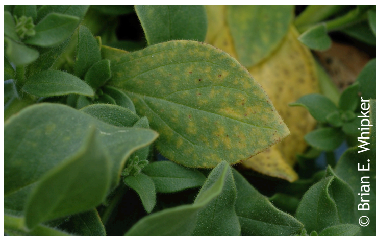
Figure 5. Lower leaves of a petunia exhibiting chlorosis (yellowing) and bronze spotting of the leaf margin due to a low substrate pH of 4.5. Bronzing is not as common with calibrachoa.