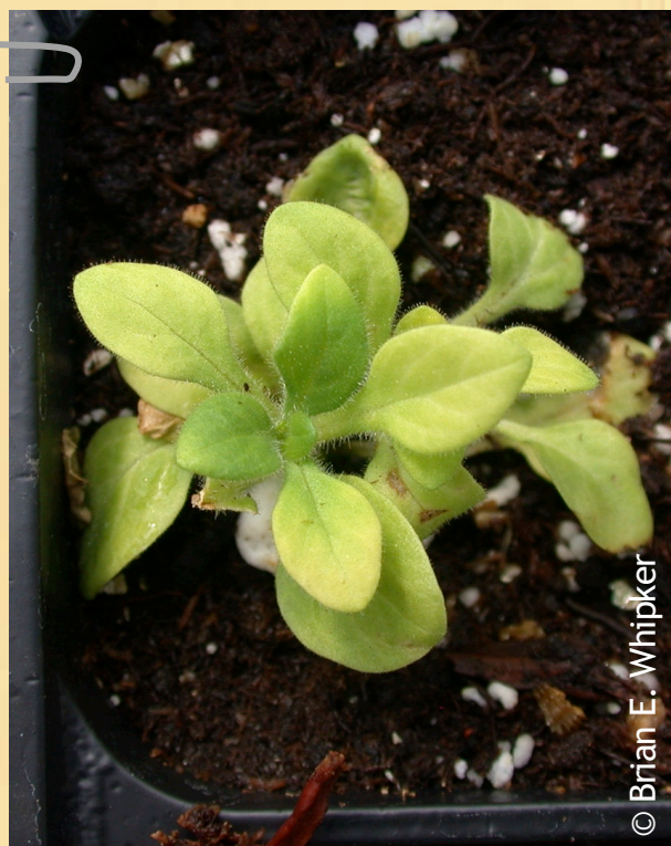
Figure 1. Providing insufficient fertility (low EC) during production of calibrachoa and petunia can result lower leaf chlorosis (yellowing).