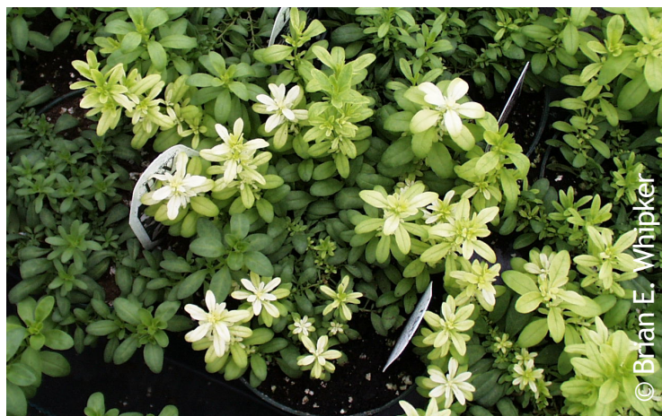
Figure 4. As a result of high substrate pH, severely Fe-deficient calibrachoa exhibit intensified interveinal chlorosis where recently matured leaves become white and mature leaves are affected.