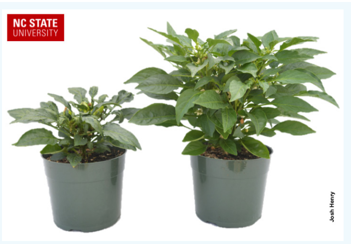
Figure 1. The first symptomatic plant on the left was easily distinguished from the healthy plant on the right.