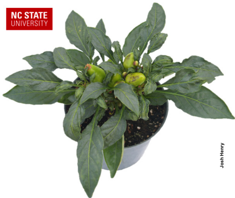
Figure 2. The plant here was severely stunted with malformed leaves.

Proper sanitation is key to preventing broad mites from becoming an issue. Growing areas should be kept weed free and cleaned thoroughly between crops. If you have a crop with broad mites, avoid working in that area and then moving to a clean crop, as you can easily move broad mites on tools and clothing.