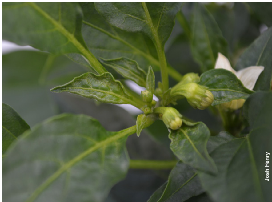
Figure 3. Stunted flower buds may be seen with distortion of the new growth.

Broad mites are often hidden in buds, so miticides that only have contact activity will not be very effective. This is especially true with peppers, which may have hundreds