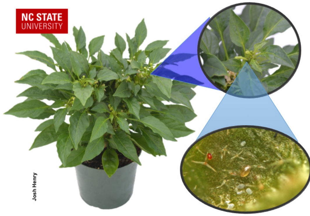
Figure 4. Nearby plants appeared healthy until further inspection of the new growth.

remove and destroy heavily infested plants when the damage is first identified, and focus on treating plants that will be saleable.