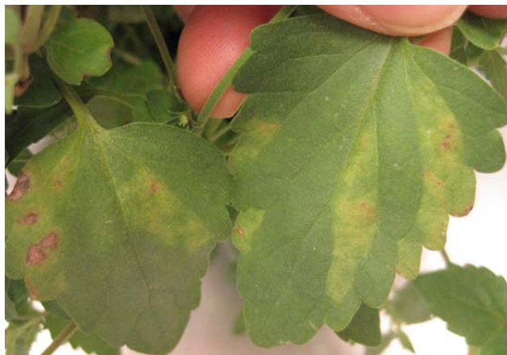
Figure 7. A downy mildew infection of agastache.