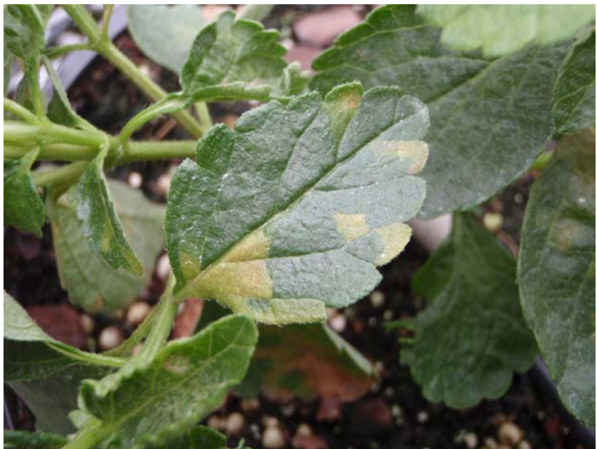
Figure 2. Initial sign of a foliar nematode infestation is the patchy, angular spots on the lower leaves.

You can send samples into a diagnostic clinic or check for nematodes yourself with a dissecting or compound microscope, with the capability of magnifying up to 40X.