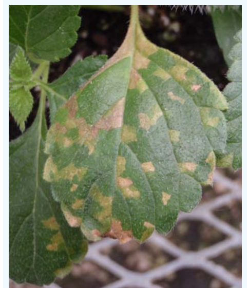
Figure 1. Angular spots appear on the lower foliage of lantana due to a foliar nematode infestation.