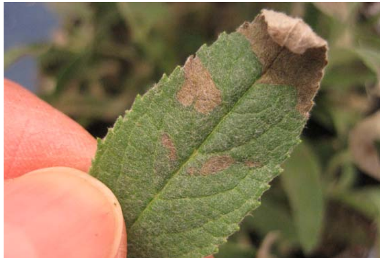
Figure 6. A downy mildew infection of buddleia.

Finally, an infection by the downy mildew ifungus also can result in angular yellowing and necrosis. This symptomology is especially true for Buddleia, Buddleja davidii ) (Fig. 6). Other ornamentals with similar symptomology include rose, veronica, and agastache (Fig. 7).