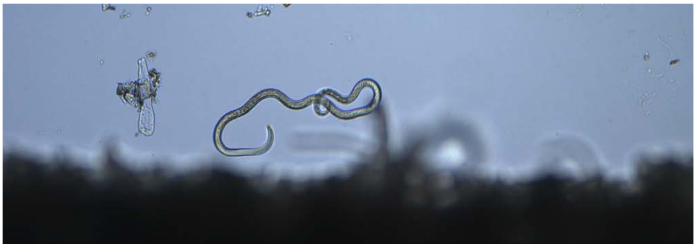
Figure 4. A foliar nematode emerging from the cut surface of a leaf, under >40X magnification.

Shurtleff, M.C. and Averre, C.W. 2000. Diagnosing Plant Diseases Caused by Nematodes. APS Press. St. Paul, Minnesota, USA. 187pp.