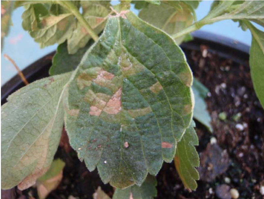
Figure 3. Necrotic spotting develops as the leaf tissue dies.