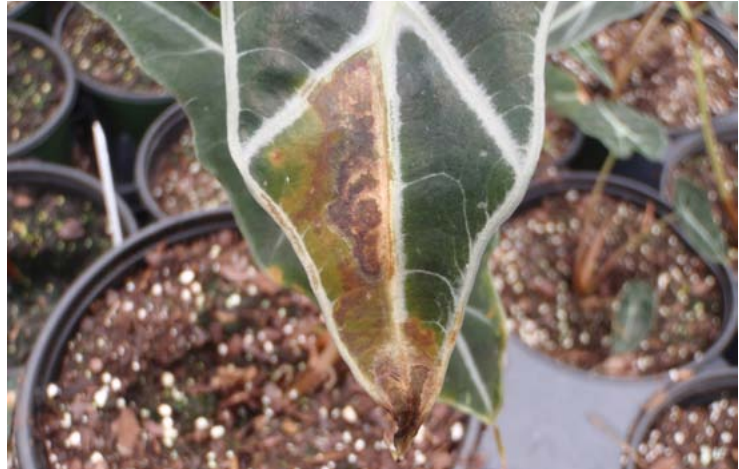
Figure 5. A bacterial infection of alopecia.

The second problem which results in angular lesions is bacterial leaf spot. (If one counts the number of samples that are submitted to the NCSU Plant Disease and Insect Clinic, bacterial leaf spot problems are more common than foliar nematode samples.) Bacteria such as Acidovorax , Pseudomonas , and Xanthomonas can cause these water soaked, angular lesions which can also develop yellow halos (Fig. 5).